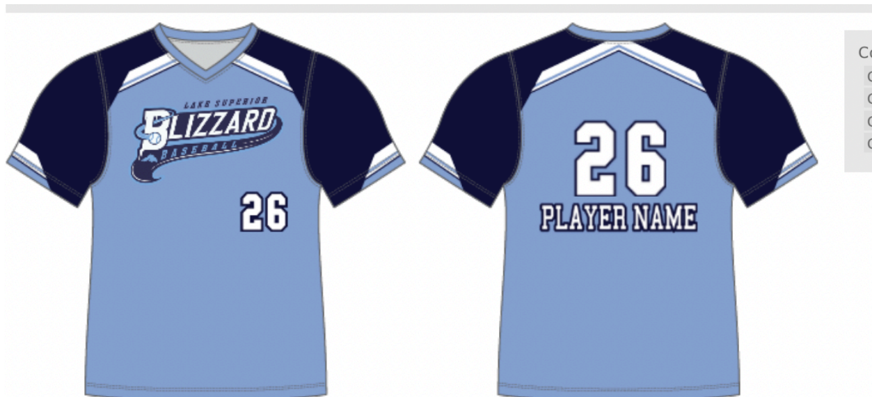
JERSEYS - J5JV1A